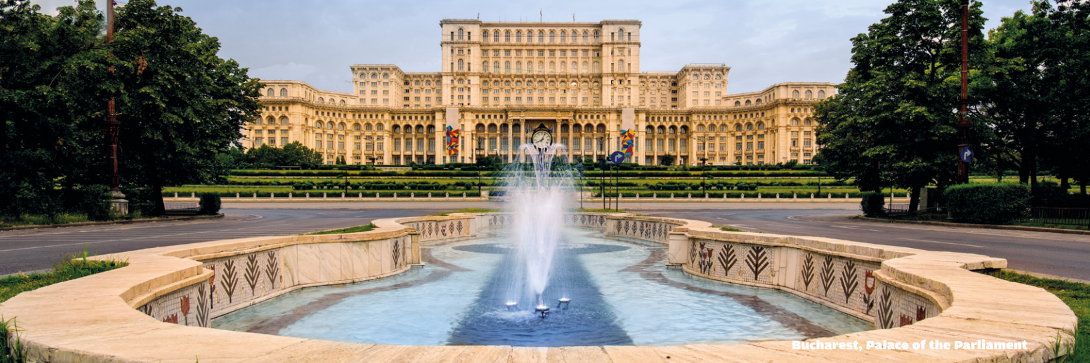
Bucharest, Palace of the Parliament