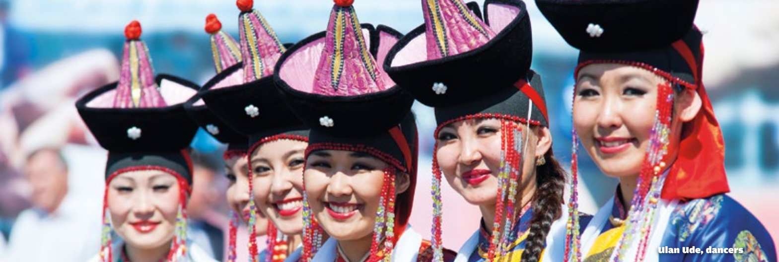
Ulan Ude, dancers