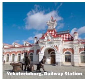
Yekaterinburg, Railway Station

This attractive provincial town is known for its wooden merchants' houses, fashionable squares and the largest statue of Lenin in the world. A worthwhile excursion out of the city is the village of the Old Believers, that refused to accept the 1652 decree which changed the Russian Liturgy. They now live in isolated communities around the world.