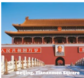
Beijing, Tiananmen Square

You are going on a journey of a lifetime, so don't rush this trip and miss out on some of the most fascinating destinations on the way. These are just some of our suggested stopovers you may take to enrich your rail journey experience. And we can tailor-make your journey to include Shanghai, Xian, Harbin ... wherever you want.