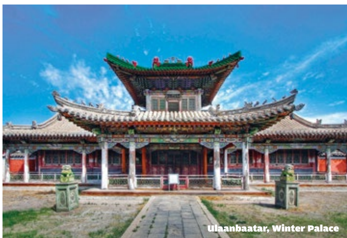
Ulaanbaatar, Winter Palace