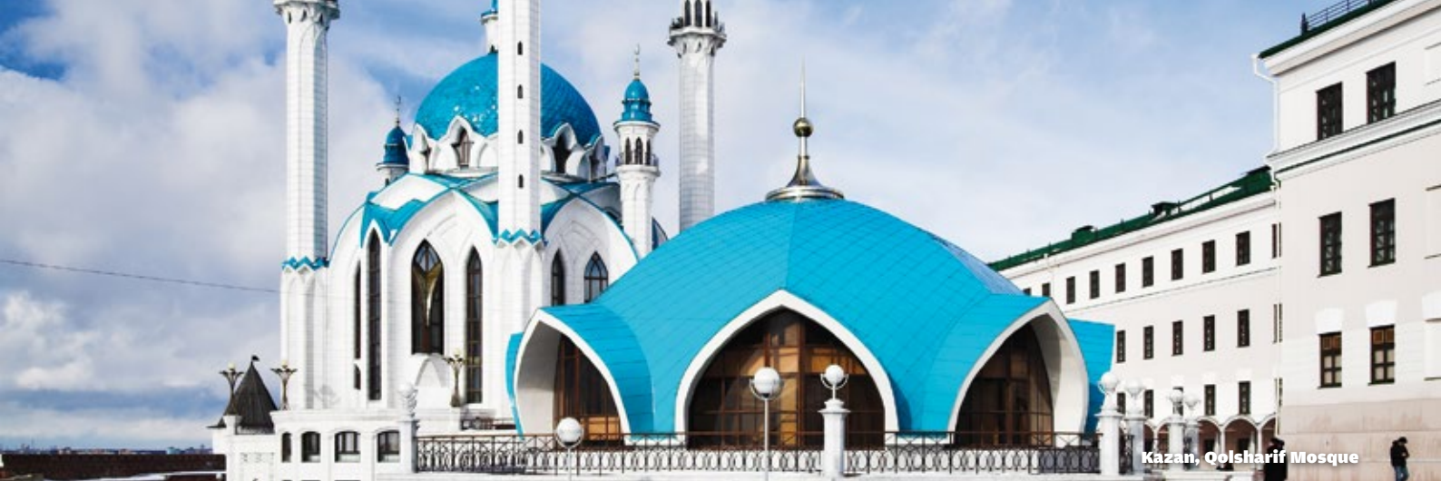
Kazan, Qolsharif Mosque

National Park, where you will spend two nights in a traditional ger. After lunch at the camp, you spend the afternoon walking in the surrounding hills. Dinner and overnight at the ger camp. BLD